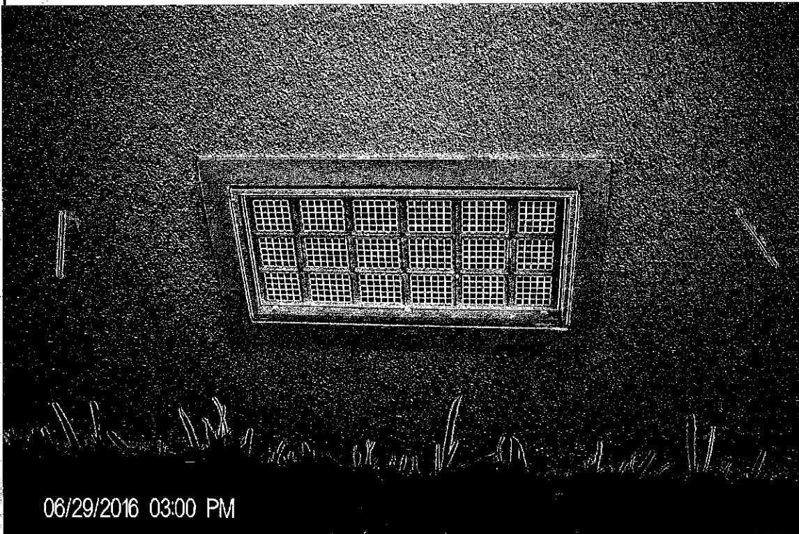
VENT FROM OUTSIDE

If submitting more photographs than will fit on the preceding page, affix the additional photographs below. Identify all photographs with: date taken; "Front View" and "Rear View"; and, if required, "Right Side View" and "Left Side View." When applicable, photographs must show the foundation with representative examples of the flood openings or vents, as indicated in Section A8.