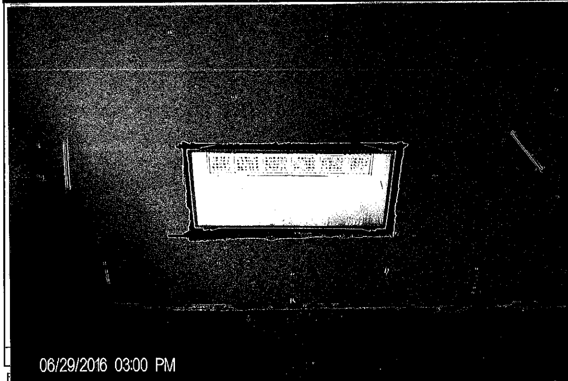
VENT FROM INSIDE